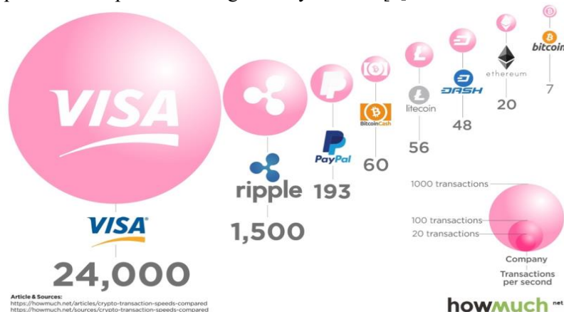
Figure 3. Transaction speed comparison: cryptocurrencies vs Visa and PayPal

A study by the People's Bank of China showed that both Bitcoin and Ethereum have poor performance of fewer than 20 transactions per second (see Figure 3), while Libra may pretend on 1000 transactions per second. That is still not enough compared to 24,000 transactions per second by Visa and peak demand of Chinese consumers of 92,771 transactions per second reported on Single's Day in 2019 [5].